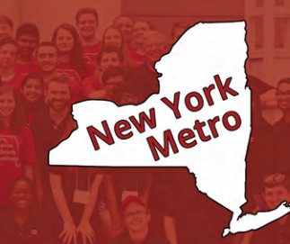
July 30 - August 12